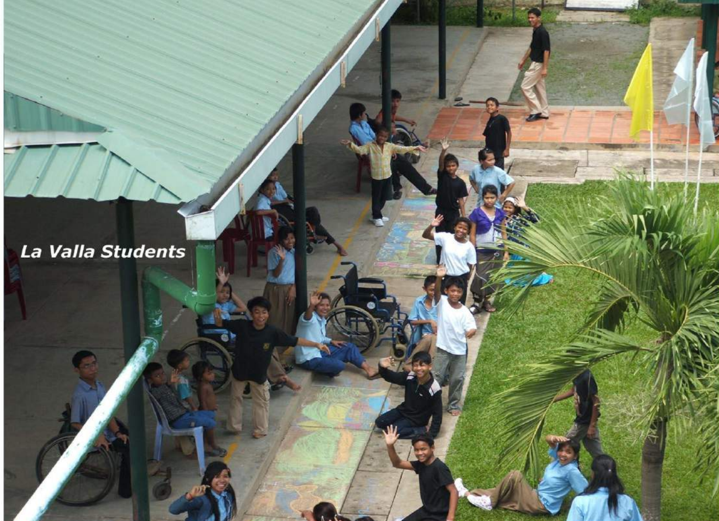
La Valla Students