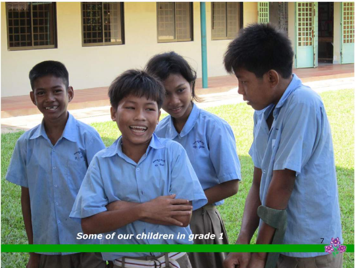
Some of our children in grade 1