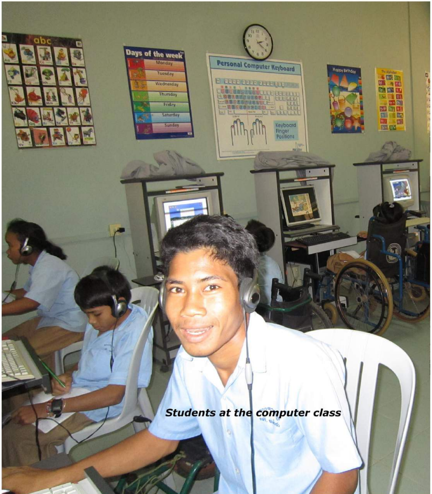
Students at the computer class

LaValla School is the only government approved school in Cambodia providing a full primary education for children and young people with physical disabilities. It is a residential program: most of the one hundred students normally enrolled live-in and its educational program is accelerated so that the six levels of elementary schooling required in Cambodia are completed in three years.