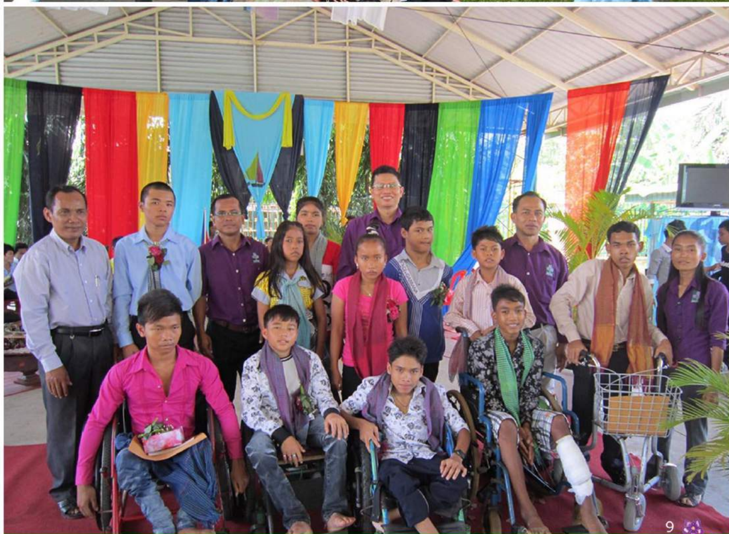
Graduating Class 6, 2011