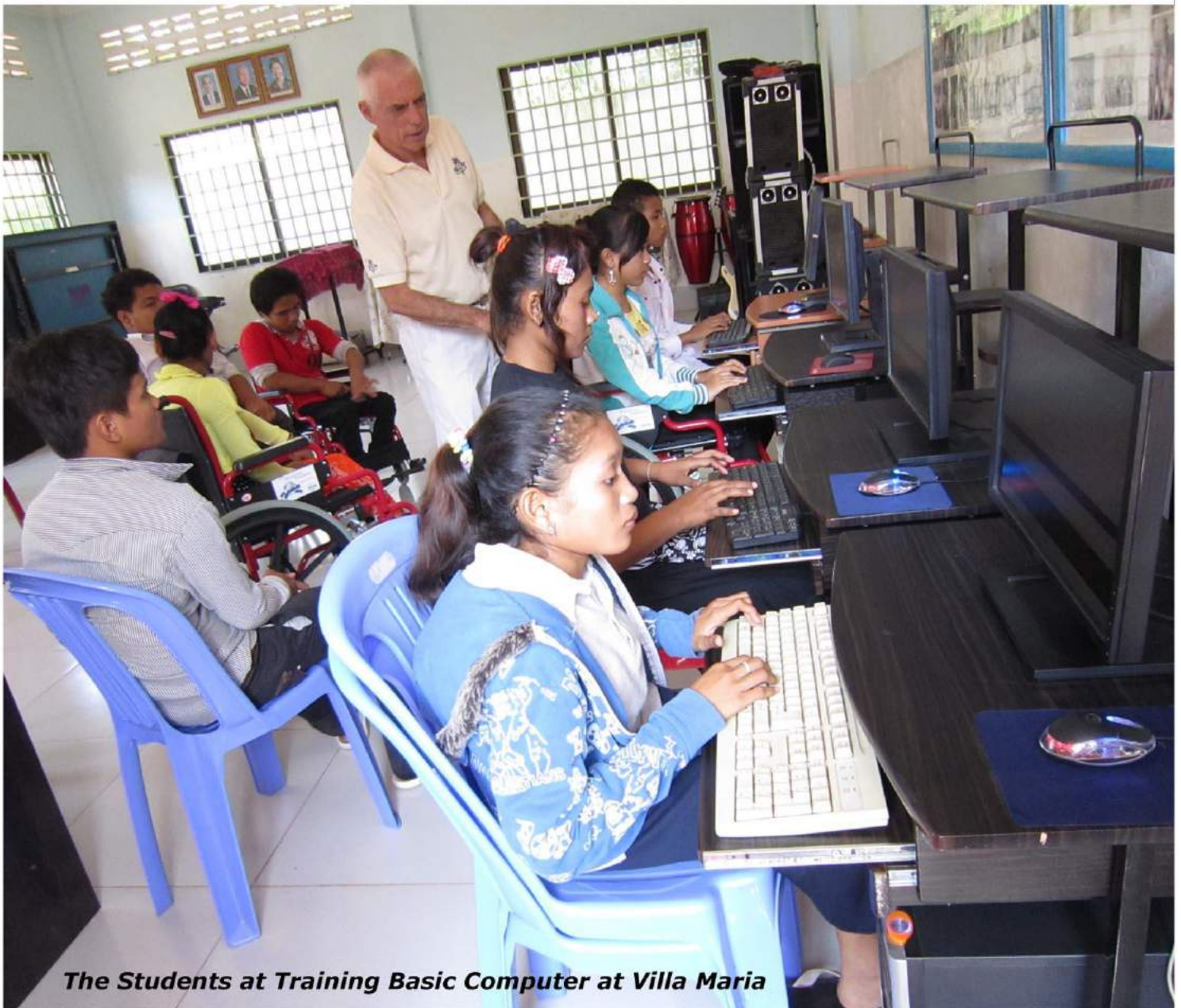
The Students at Training Basic Computer at Villa Maria

Villa Maria aspires to be a home away from home: there is a consistent emphasis on creating a family atmosphere and fostering confidence and self reliance among all its residential students.