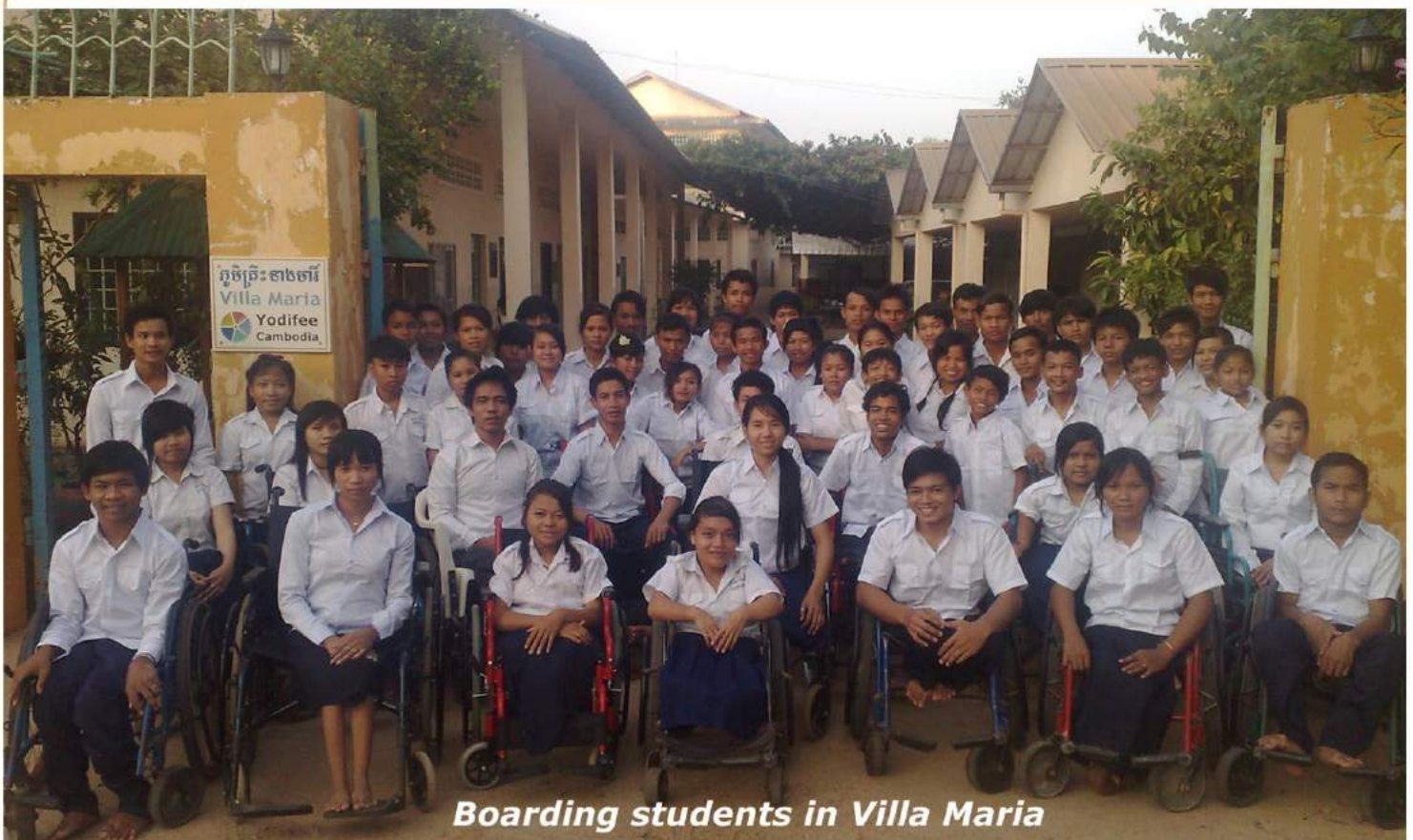
Boarding students in Villa Maria

The German organization Misereor provides funds to help young people with disabilities continue their tertiary education. Those receiving this support live together in Phnom Penh where they are attending various universities. Each of them is committed to some voluntary work with our organization once they have finished their respective courses.