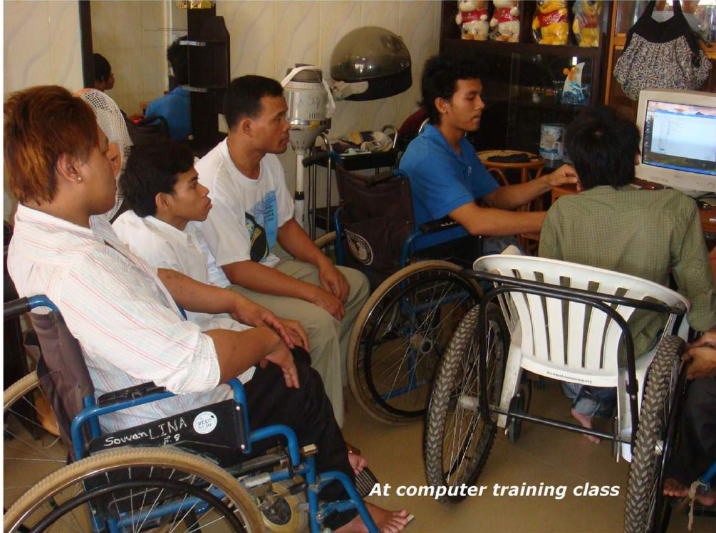
At computer training class